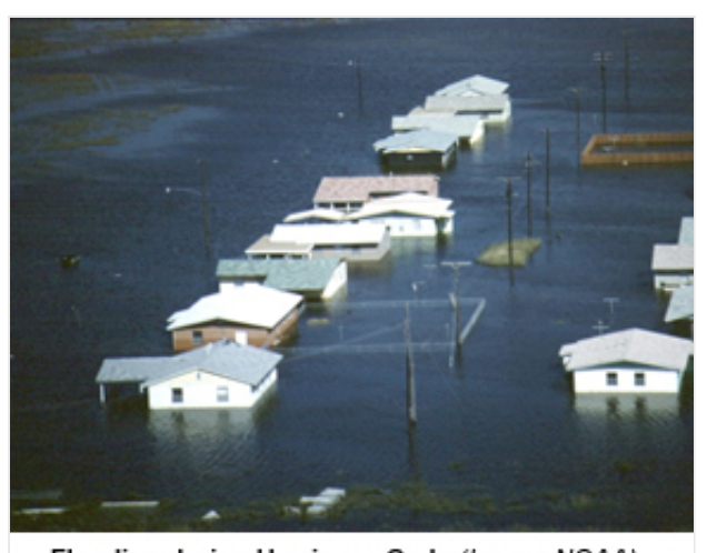
Flooding during Hurricane Carla

It was eerie playing outdoors while the clouds grew dark and swirly. I remember it looked like night, in the middle of the afternoon. It began to rain. The wind began to howl and something in the air made us feel wild and free. We waded in the ditches trying to catch crawfish but when the lightning began to strike dangerously close to the crackle of thunder, my mother called us in. We were drenched. Despite the edge of fear in the air, it was exciting and we all remained in high