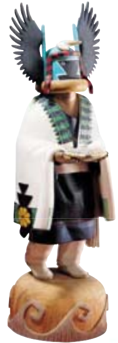
▼ Kachina doll

Kachina ceremonies are an important part of the Hopi religion. The kachinas are spirits who